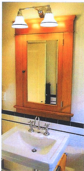
Woodwork on a 33rd Street house in North Park.